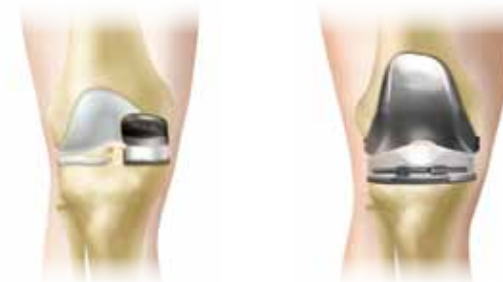
Oxford® Partial Knee

The traditional approach to total knee replacement uses implants to resurface all three compartments of the knee.